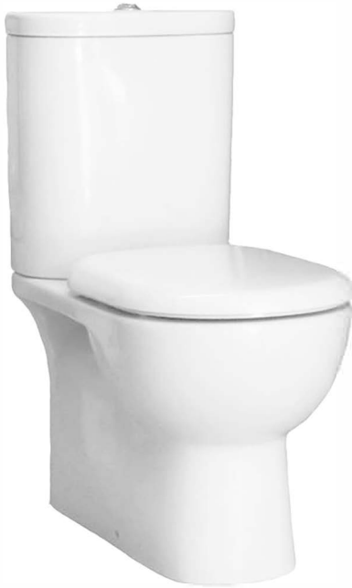
WCKENT: 370mm x 660mm x 836mm