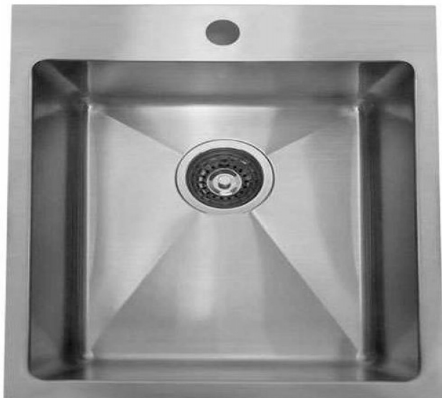
TECH105ND : 550mm (L) x 500mm (W) x 210mm (H)