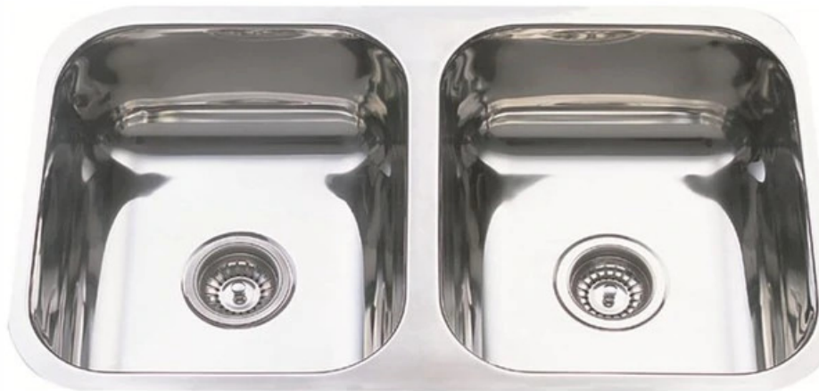
PAC200U: 780 mm (L) 445 mm (W) 170 mm (D)