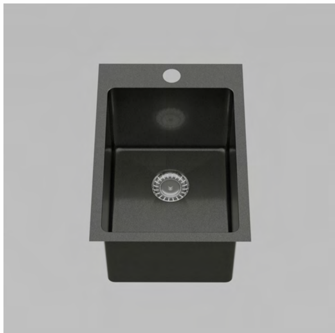
LT30Q: 350mm x 500mm x 250mm