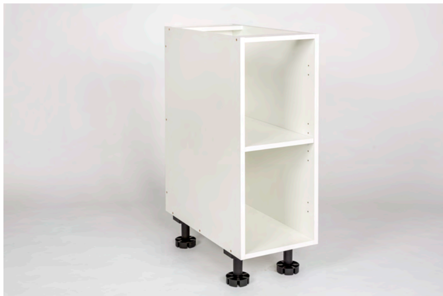
FKC300B : 300mm x 580mm x 730mm