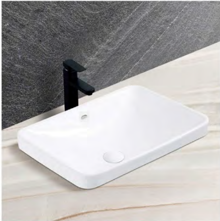
BAQCARLA460: 460mm (L) x 330mm (W) x 170mm (D)